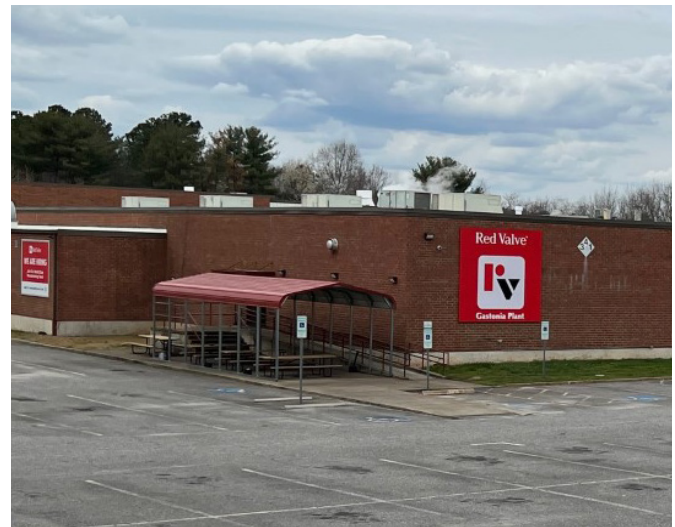
Red Valve's manufacturing plant, located in Gastonia, NC.