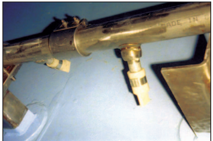
When closed, the Tideflex® Diffuser Check Valves keep the slurry from entering the sparge system.